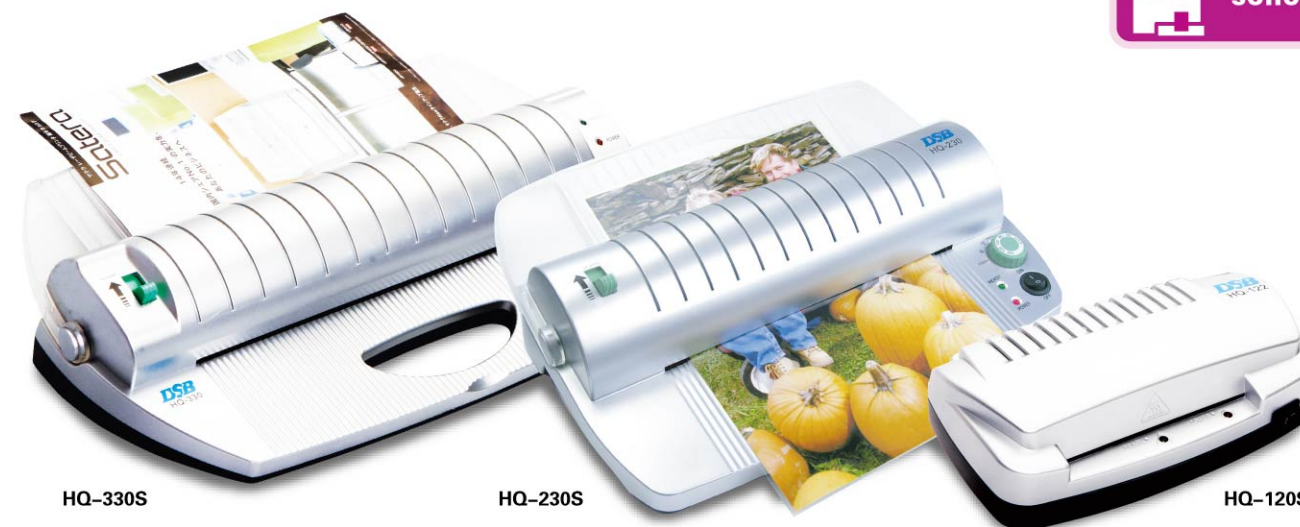
HQ-330S HQ-230S HQ-120S